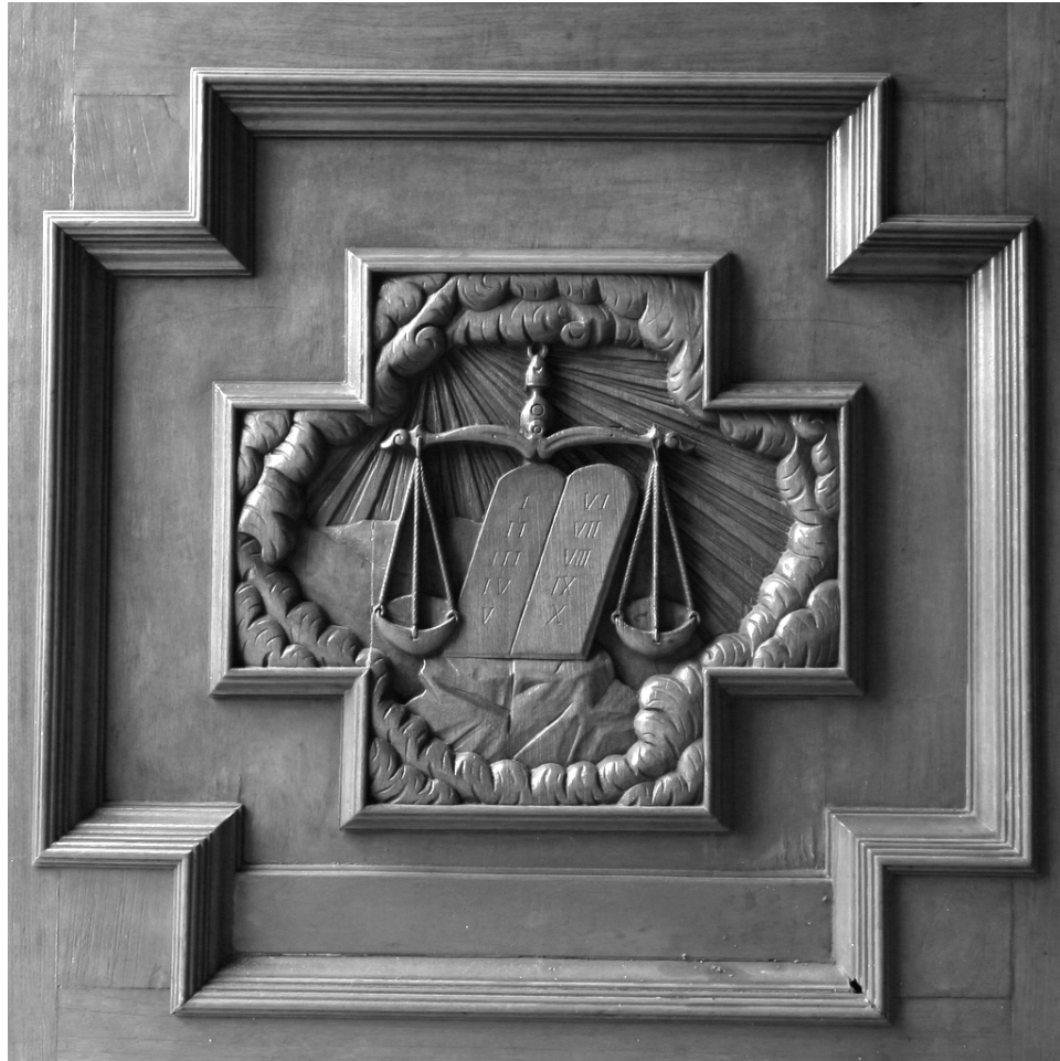
Ten Commandments with scale of justice. Unidentified wood carving. From Art in the Christian Tradition , a project of the Vanderbilt Divinity Library.