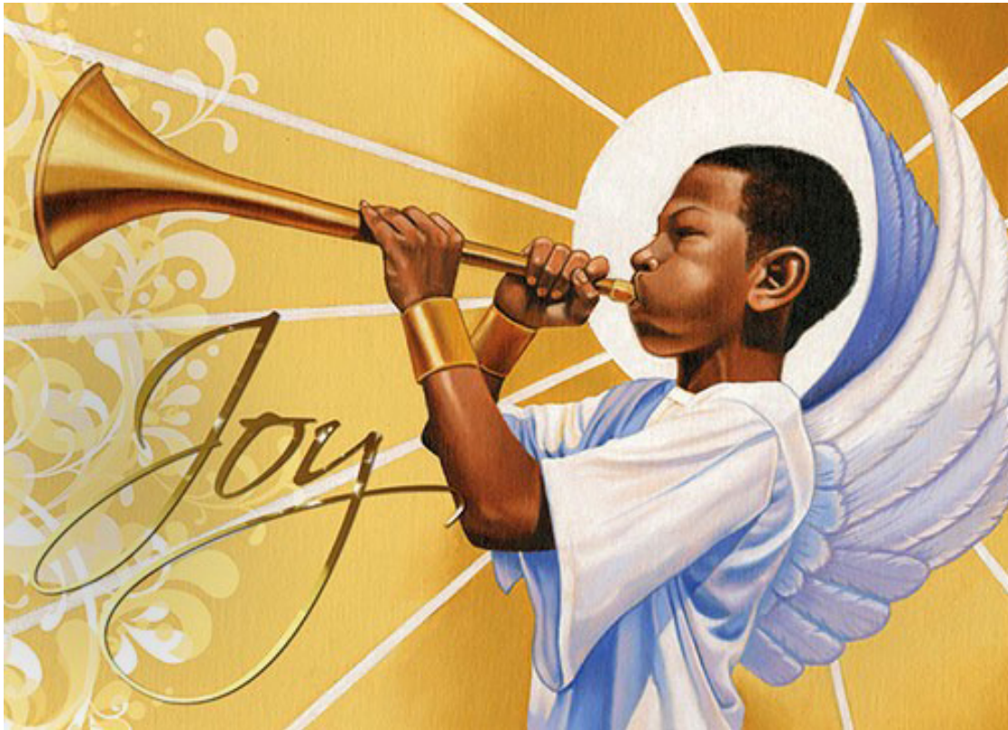
Joy to the World! From Art in the Christian Tradition, a project of the Vanderbilt Divinity Library.