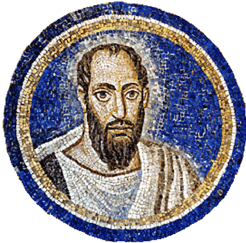
Mosaic of St. Paul. 494-495 A.D. from Ravenna.