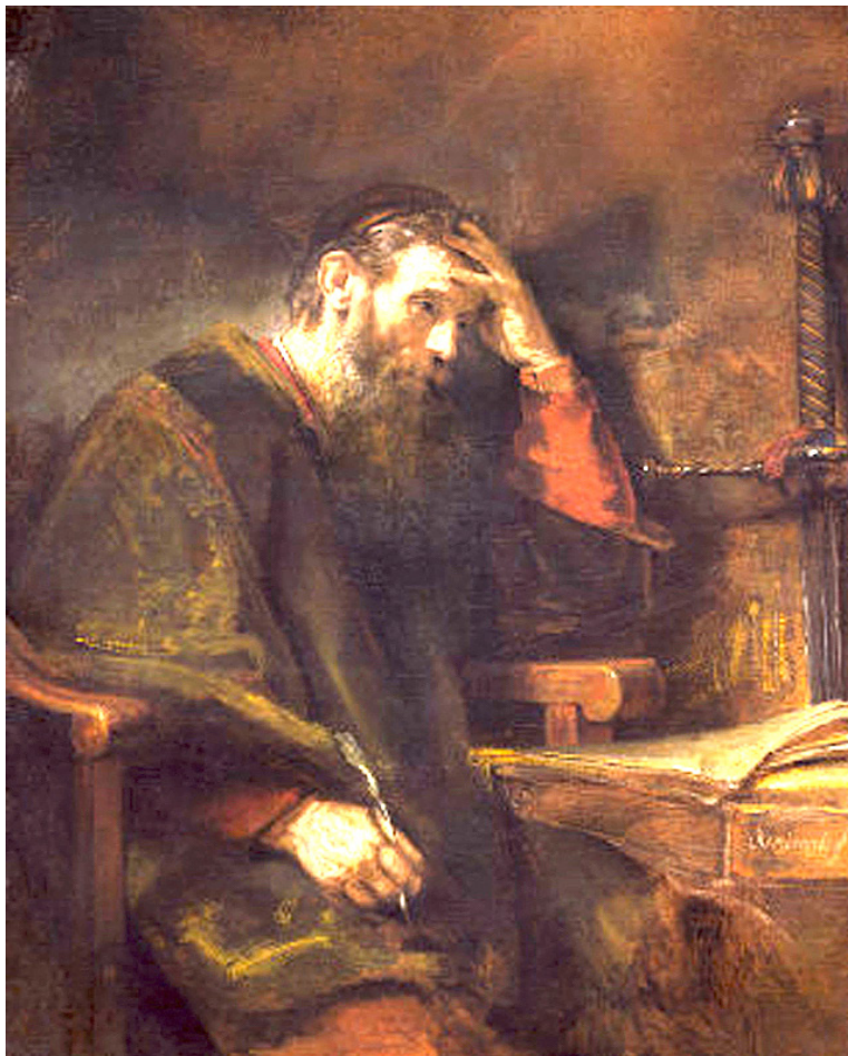
Apostle Paul, Rembrandt Harmenszoon van Rijn, 1606-1669