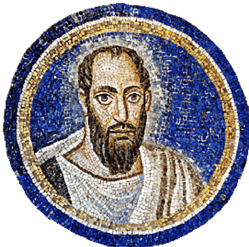
Mosaic of St. Paul. 494-495 A.D. from Ravenna.