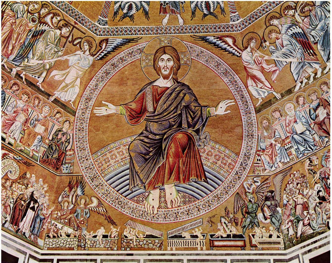
Christ in Judgment, 1300, Florence, Italy