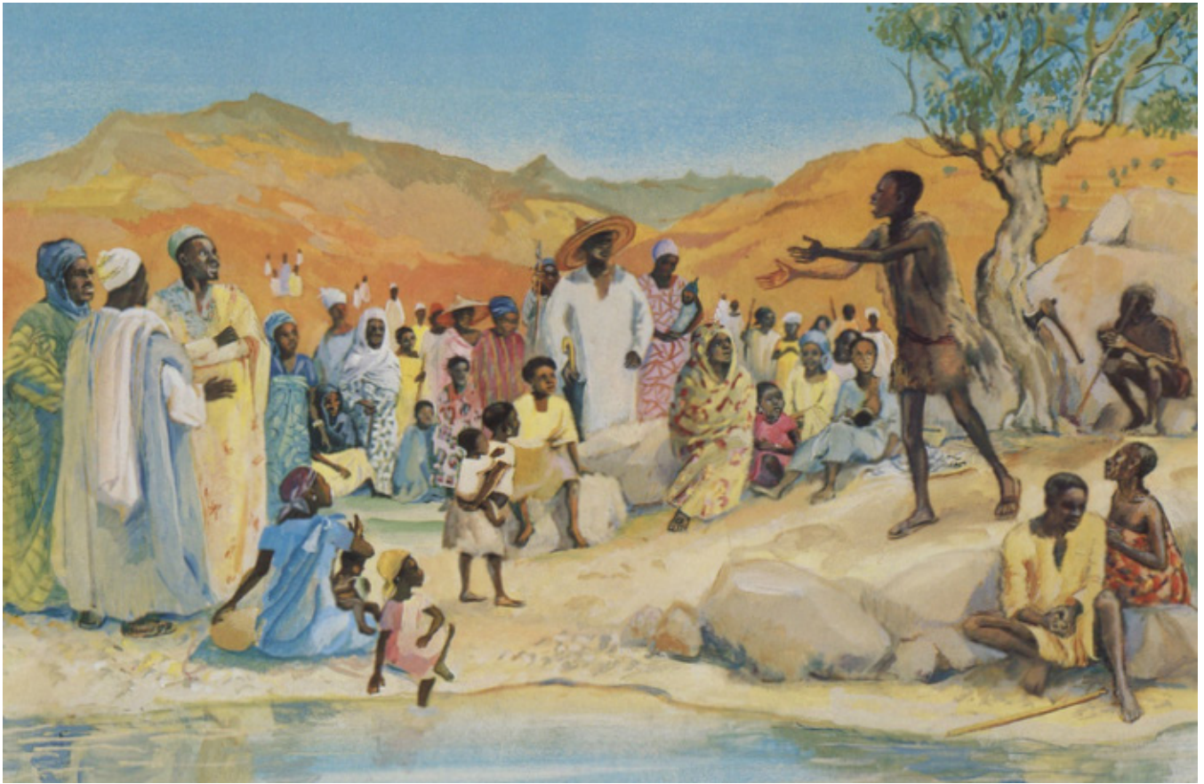
John the Baptist preaching in the desert, Jesus Mafa