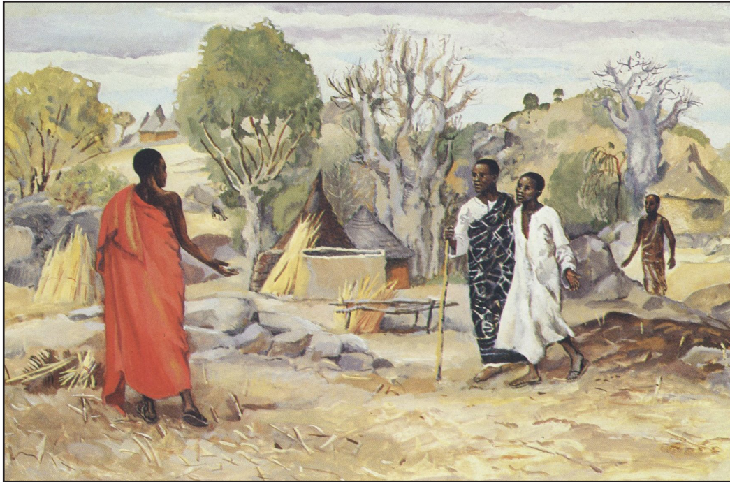
The first two disciples, Jesus Mafa