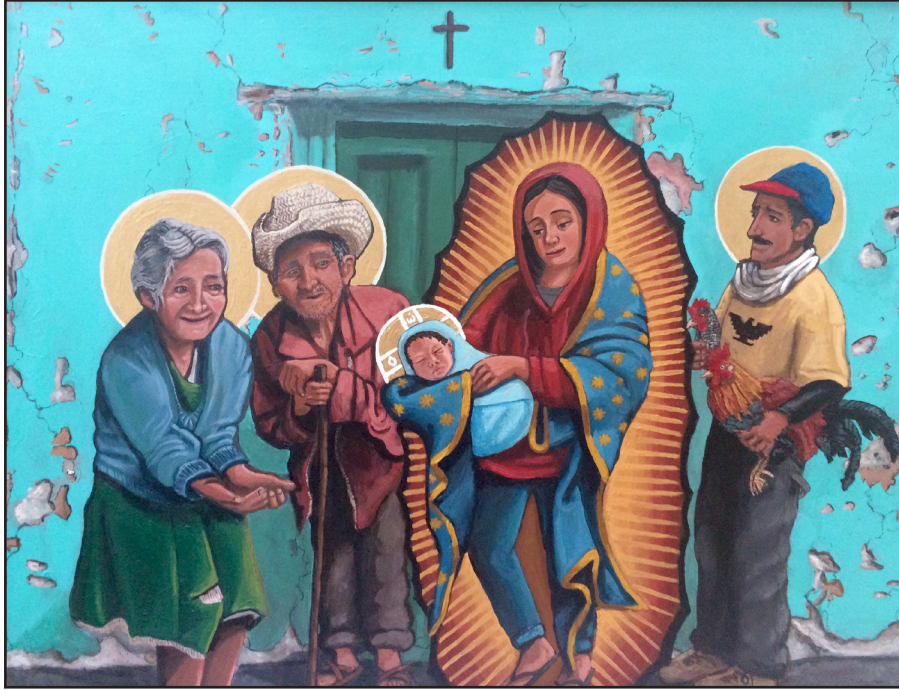
La presentación de Cristo en el templo, Kelly Latimore