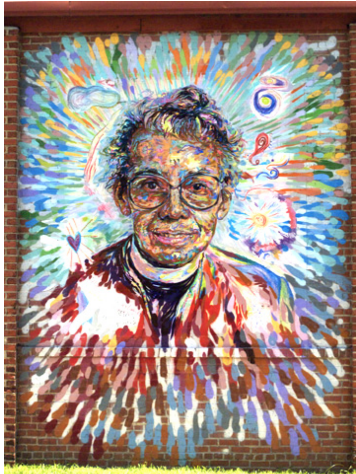
Pauli Murray in the World, Durham, NC