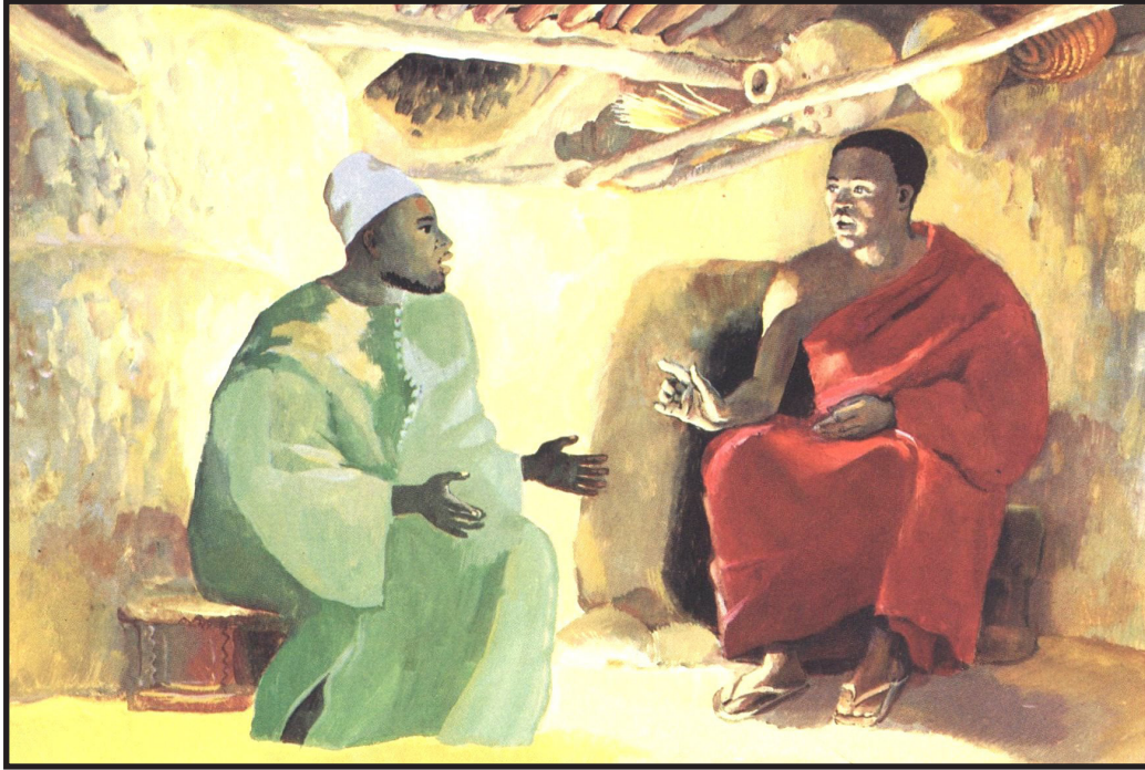
Nicodemus, JESUS MAFA